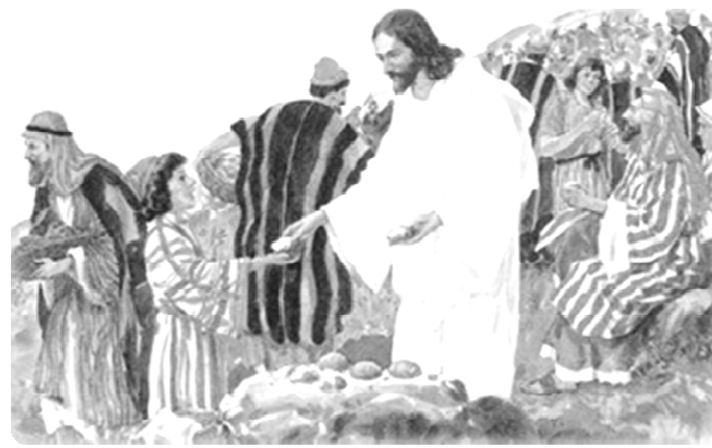
When the people saw the sign he had done, they said, "This is truly the Prophet, the one who is to come into the world." Jn. 6:14