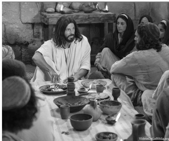
Your word, O Lord, is truth; consecrate us in the truth.